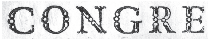
Ornated capitals that inspired Dejanire Jewel [Barcelona, 1800].